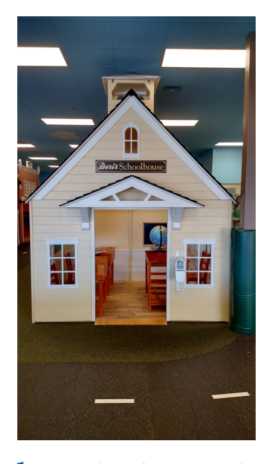
The school house has desks and a globe. We can pretend that we are at school.