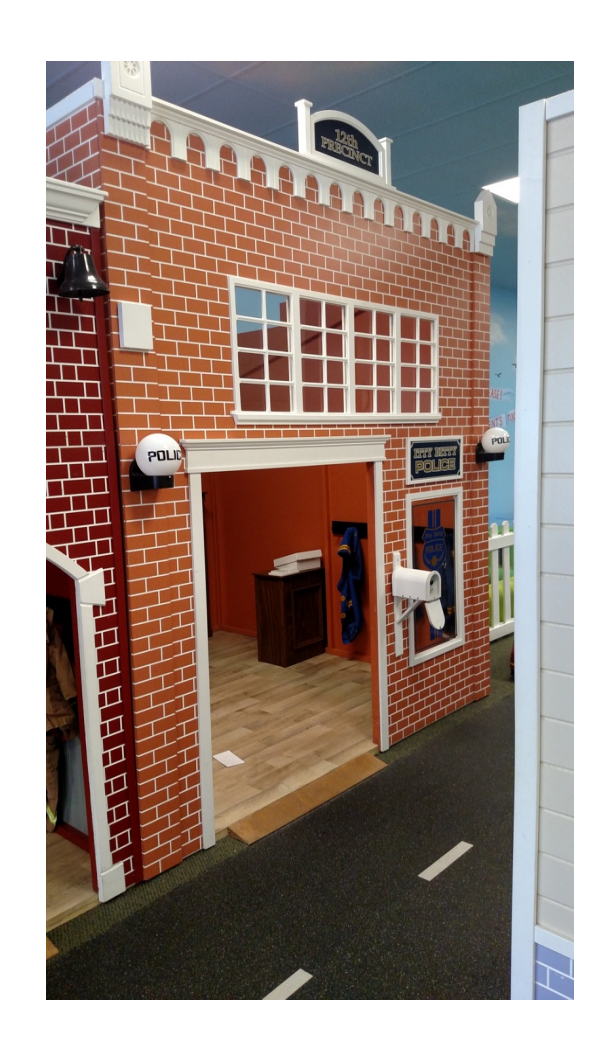
We can go to the police station. We can put on a police uniform too!